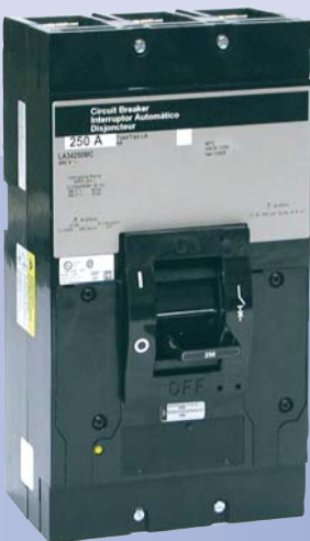
Square D® FA/KA/LA/MA Family of Circuit Breakers

The philosophy behind the Square D® and Telemecanique® product families has been to always put safety first. Schneider Electric is committed to electrical safety and providing our customers with UL listed products and innovative solutions to support the safe construction and installation of control panels.