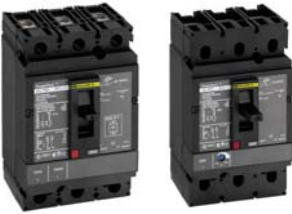
Square D Powerpact® H- & J-Frame Circuit Breakers

By purchasing coordinated products from Schneider Electric, your installation will perform as rated because our components have undergone UL testing.